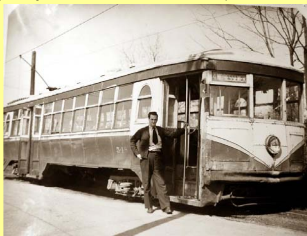
A streetcar from Birmingham's past...the Bessemer No. 4

The cars themselves may come from Milan, Italy, which has a fleet of vintage cars from the 1920s for sale for $25,000 to $35,000 each. Hill said most fully restored vintage streetcars cost $200,000 to $800,000 each; in this case, the city would have to do some updating, such as adding air conditioning, but the cars are generally service-ready.