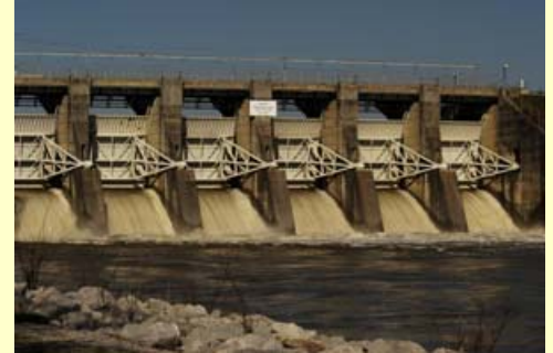
Logan Martin Dam on the Coosa River.