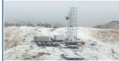
USCG Rescue 21 AK Remote Sites