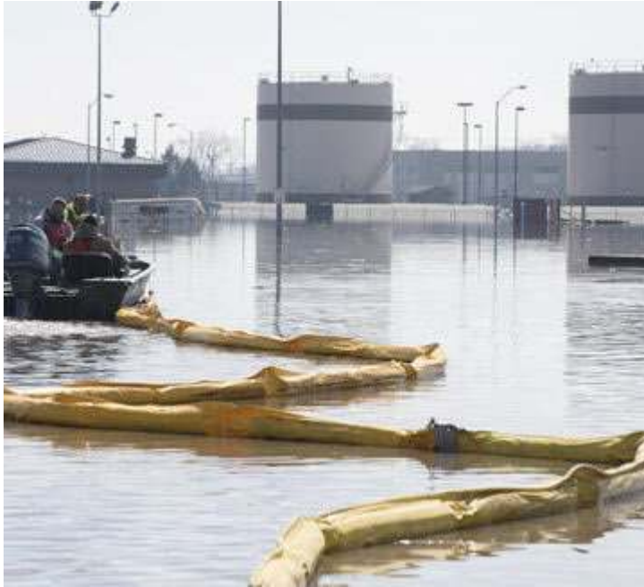
One-third of the Offutt Air Force Base, near Omaha, was flooded last week.