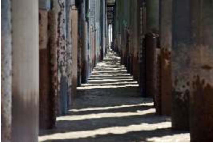
Corrosion of the pilings at the Port of Anchorage are one of the reasons officials say the port requires a modernization project. Photographed on Thursday, July 7, 2016.