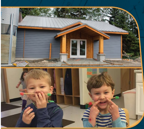
Chillkat Valley Preschool - Haines, AK - 2017

Haines and Juneau Locations • www.proHNS.com • Visit Us on Facebook