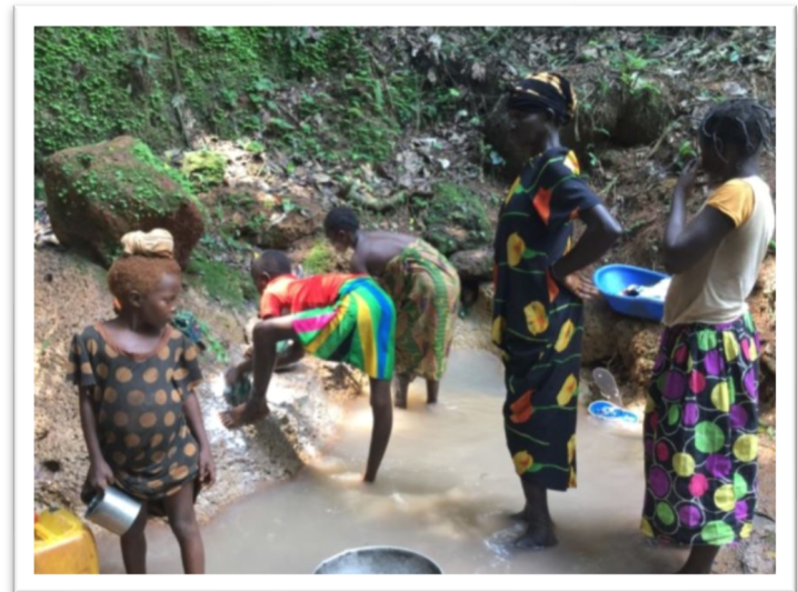
Children collect water from local springs.