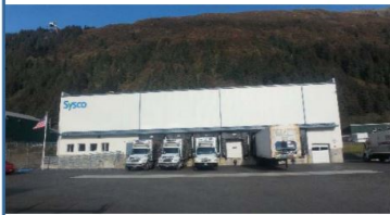
Sysco Building, Juneau