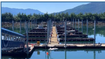
Shoemaker Harbor, Wrangell

TETRA TECH ALASKA, LLC SERVING ALASKAN COMMUNITIES FOR OVER 40 YEARS www.tetrattech.com