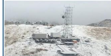
USCG Rescue 21 AK Remote Sites