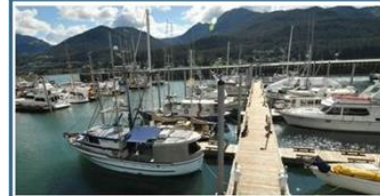
Aurora Harbor Rebuild, Juneau