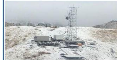
USCG Rescue 21 AK Remote Sites