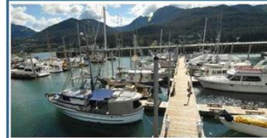
Aurora Harbor Rebuild, Juneau