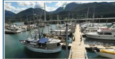
Aurora Harbor Rebuild, Juneau