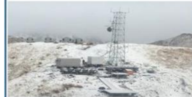
USCG Rescue 21 AK Remote Sites