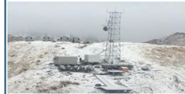
USCG Rescue 21 AK Remote Sites