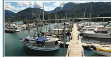
Aurora Harbor Rebuild, Juneau