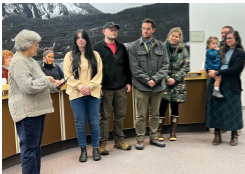
Pictured above: JunEAU Engineers standing for E-Week proclamation at the Feb. 5th assembly meeting

The Sealaska Heritage Institute works with public school teachers through its STEAM program, which teaches math skills to middle-school students through Northwest Coast art. Teams of teachers, artists, and SHI staff are producing, field testing, and disseminating a series of supplemental math resources that incorporate Tlingit culture and language geared for beginning algebra and geometry courses. Applications for summer internships, mentors, hosts, and classes are open for 2024. Visit https://www.sealaskaheritage.org/institute/education/programs#STEAM for more STEAM information.