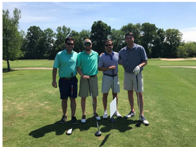
2nd Place Championship Flight - Team Foley Products