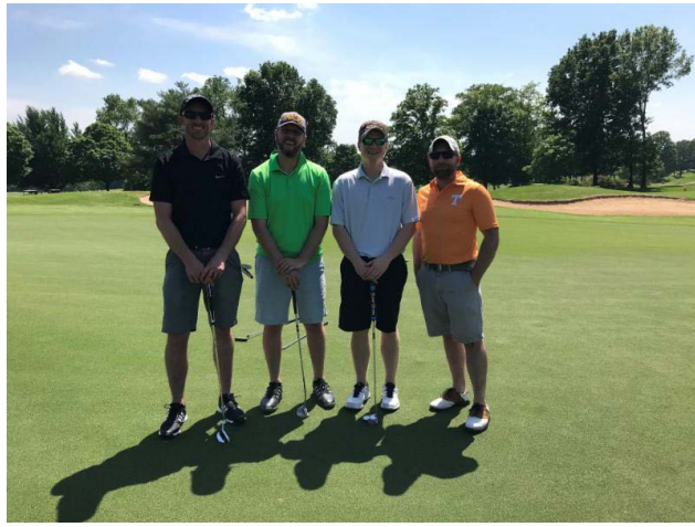
2nd Place 2nd Flight - Team Intertek PSI

Our next sports even will likely be our Card Tournament toward the end of the year.