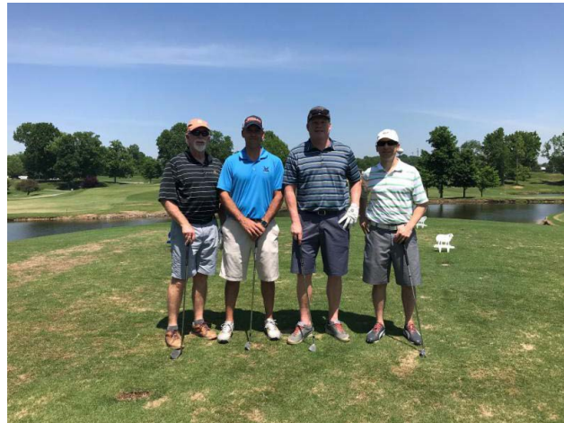
1st Place Championship Flight - Team SSR