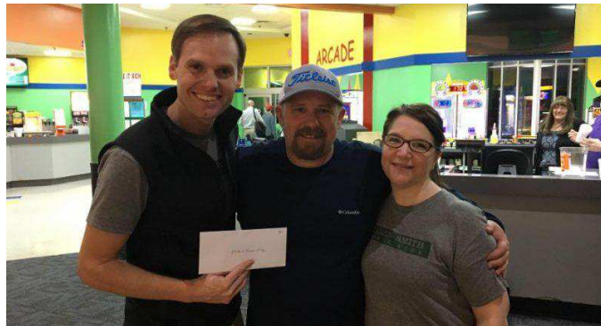
1st Place: Ragan Smith