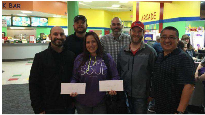
2nd & 3rd Place: PCA