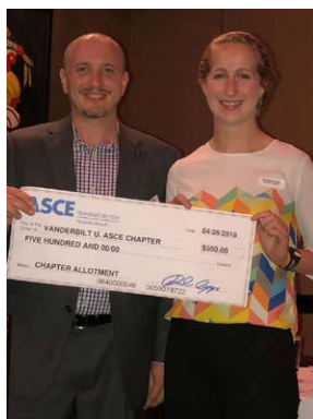
ASCE Student Chapters receiving their allotments from the Nashville Branch