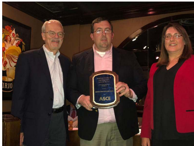
Large Project of the Year: Division Street Extension Bridge Project / Gresham Smith