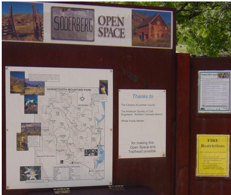
Bulletin Board at Soderberg trailhead. Note recognition of No. Colo. Branch, ASCE in center.