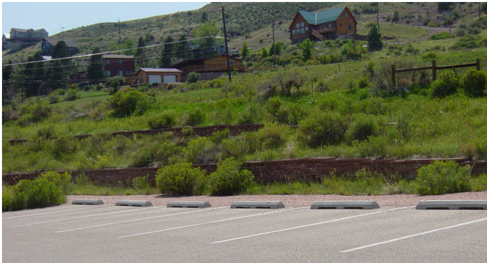
Completed parking area at Soderberg trailhead.