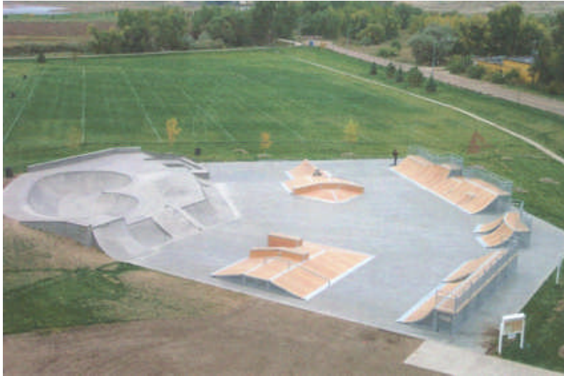
Windsor Skate Park. Phases 1 and 2 completed October, 2003