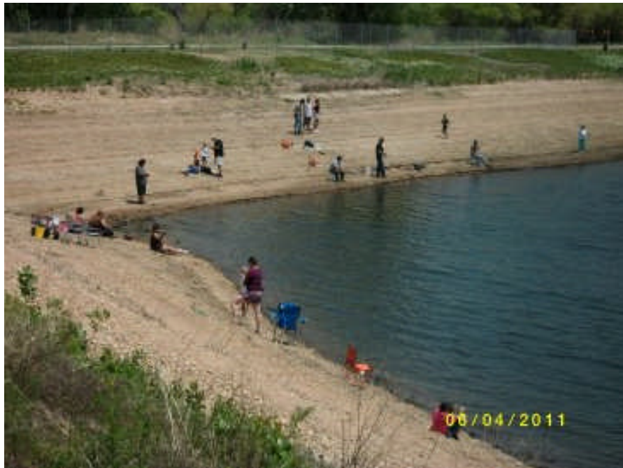
The Public enjoying a Poudre Pond