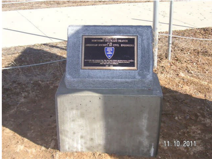
Poudre Ponds Plaque