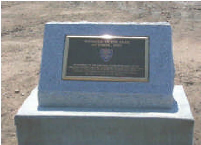
ASCE Monument at Windsor Skate Park