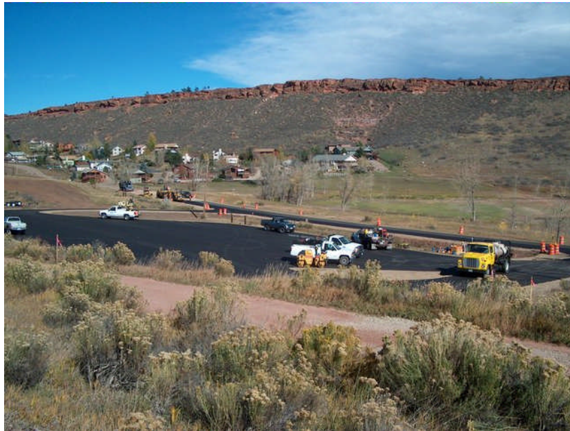
Soderberg trailhead being paved.