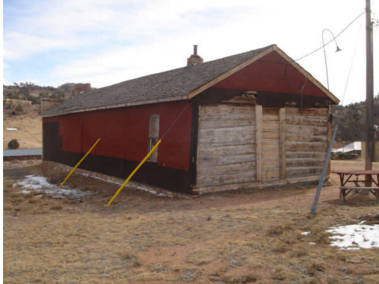
Virginia Dale (Colorado) Stage Coach Station as of 2011. The restoration of this historic structure will be the NCB's fourth Community Service Project.