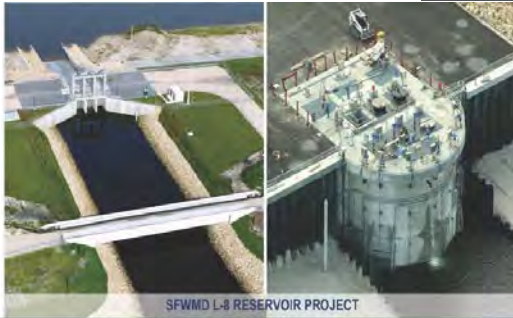
SFWMD L-8 RESERVOIR PROJECT

Deerfield Beach Jacksonville Miami Orlando Palm Beach Gardens Tallahassee Tampa