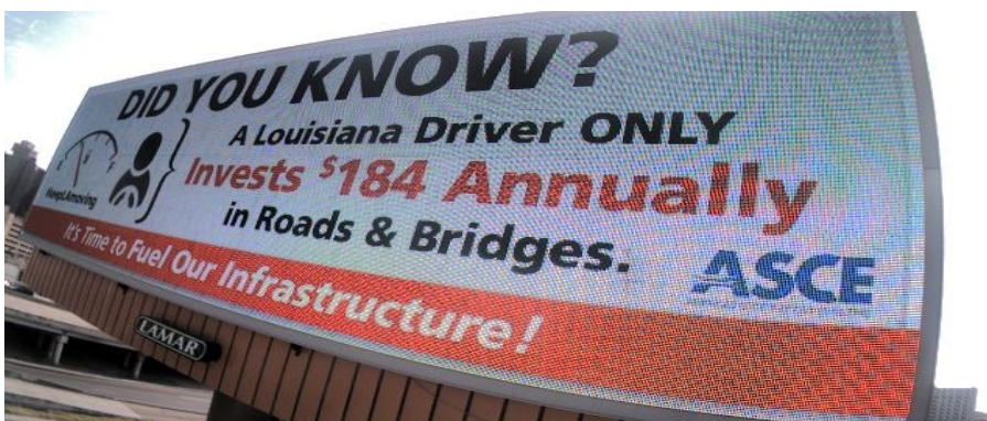
2016 SPAG Funded Billboard for to help raise awareness about the lack of permanent, revolving infrastructure funding

Nationals offers free Drupal websites to Sections and Branches. These Drupal websites use a web-based content management system (CMS), so special software is not needed to make updates. The CMS uses a very simple editor, similar to what you find in Microsoft word. A few branches who have recently taken advantage of this wonderful opportunity are Nashville, Akron-Canton, and Tennessee. Be on the lookout for ours!