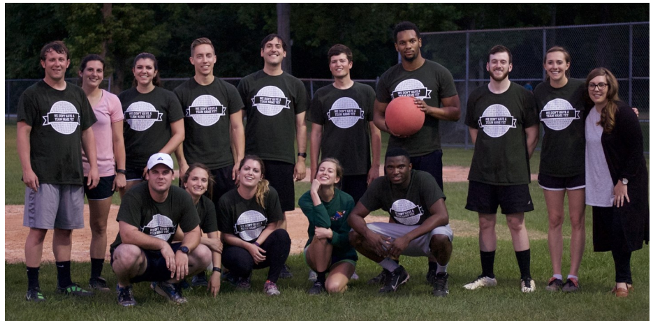
2016 Younger Member Kickball Team

Kickball full album with the pictures: https://goo.gl/photos/3PHdnCyWRSISGcx17