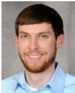
LSU Practitioner Advisor