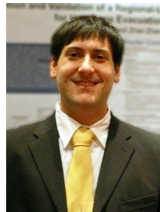
Younger Member Chair