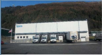
Sysco Building, Juneau