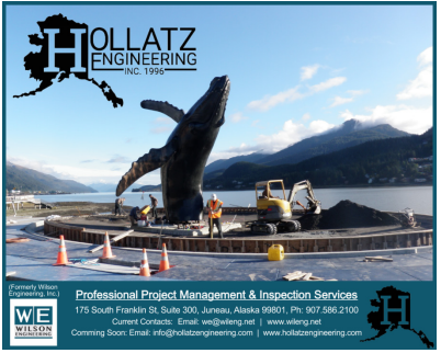
Thank You to Our Sponsors!