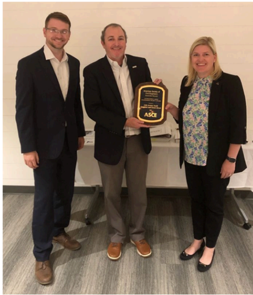
Outstanding Large Engineering Project 12 th Avenue South Complete and Green Street CDM Smith and LDA Engineering for NDOT