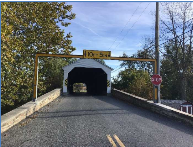
Pleasantville Bridge Over Little Manatwny Creek - Oley Township, PA

The Pleasantville Bridge was constructed by an accomplished builder named David Renno in 1854, to replace a span that had been destroyed by a major flood in 1850. Renno was paid $2,156 to design and construct the double Burr Arch truss, which spanned 142 feet from portal to portal. Although timber bridges of this era were normally roofed to protect the main structural elements from the weather, a lumber shortage caused by the 1850 flooding made this impossible.